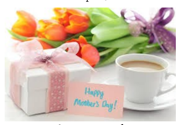
Hope to see you there!