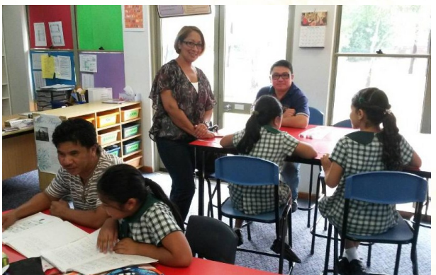
Parents & students during open classrooms yesterday.

We ask this through Christ, our Lord. Amen.